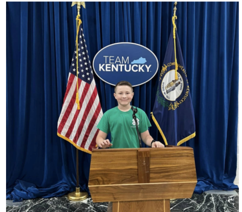
Trip to the Capitol