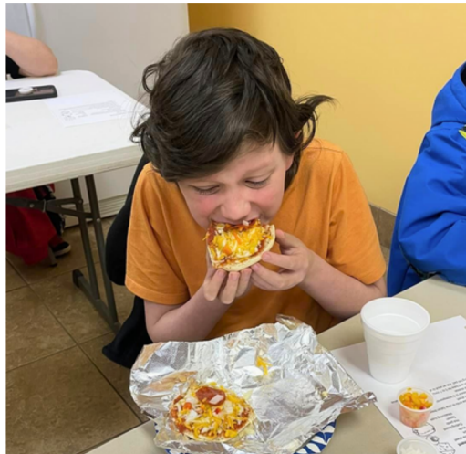
March Cooking Club