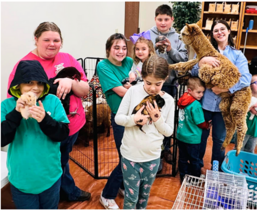
Livestock Club at Preschool Palooza